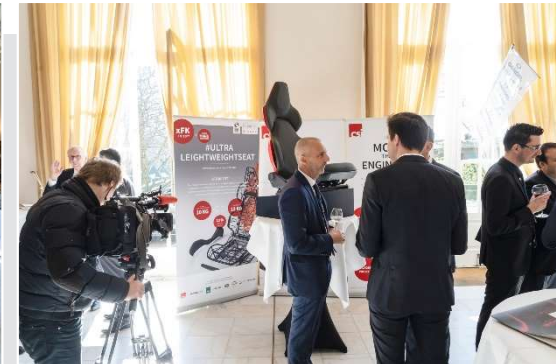
Discussions during breaks at the LIGHTWEIGHT SYMPOSIUM on 07.02.2020 in Mondorf, Luxembourg